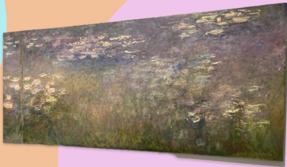
Agapanthus Claude Monet 1915 - 1926