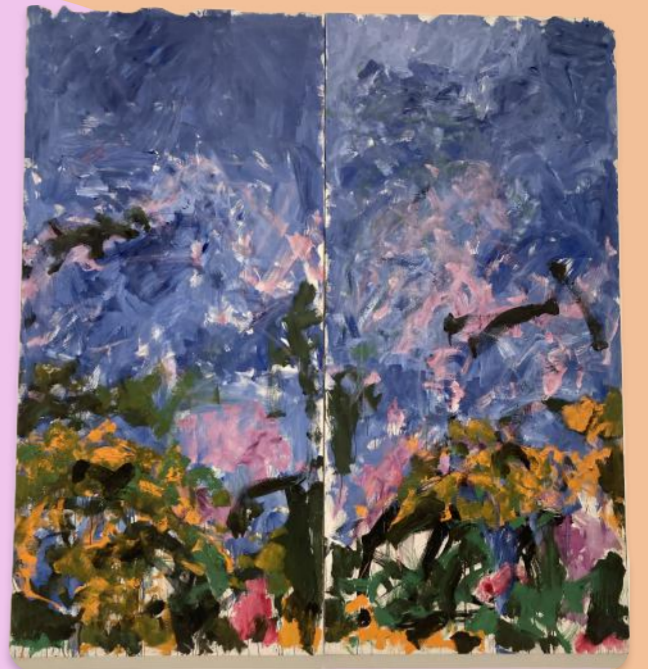
La Grande Vallée VI Joan Mitchell 1983