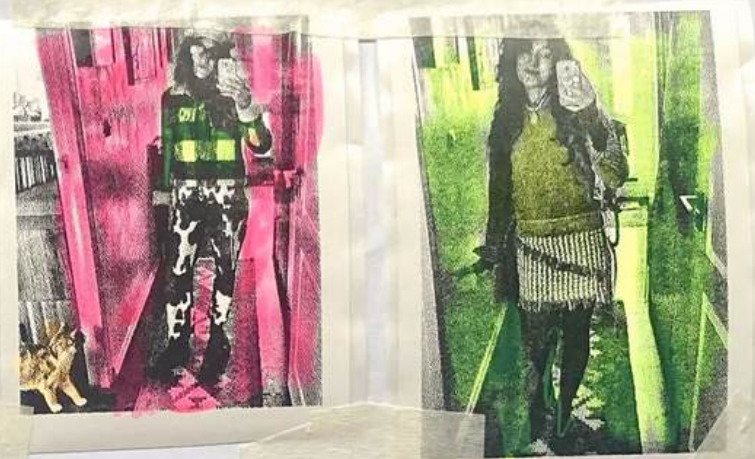
TWEED + GREEN.