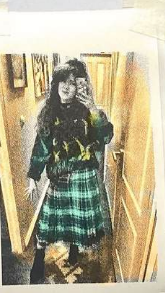
PLAID + TIE / BGRAM CUB