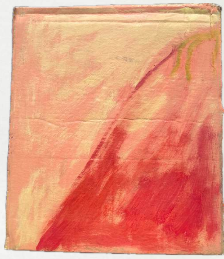
A DRAMATIC HILL TO DIE ON.