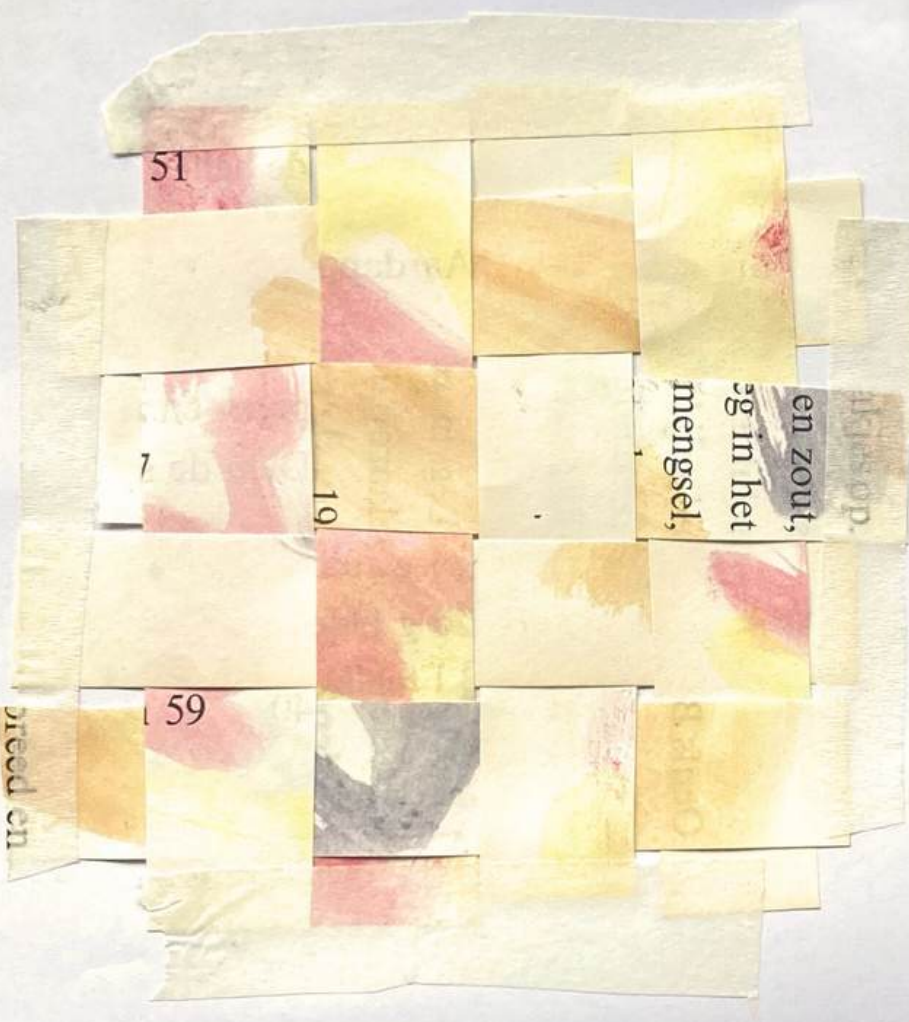
PLAID + COY PRINT