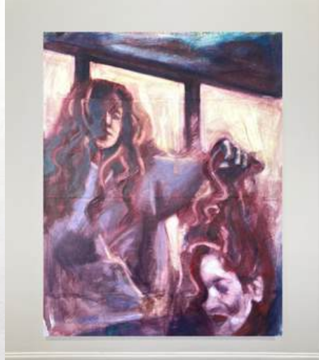
"DAVE N BIG 4" 2025