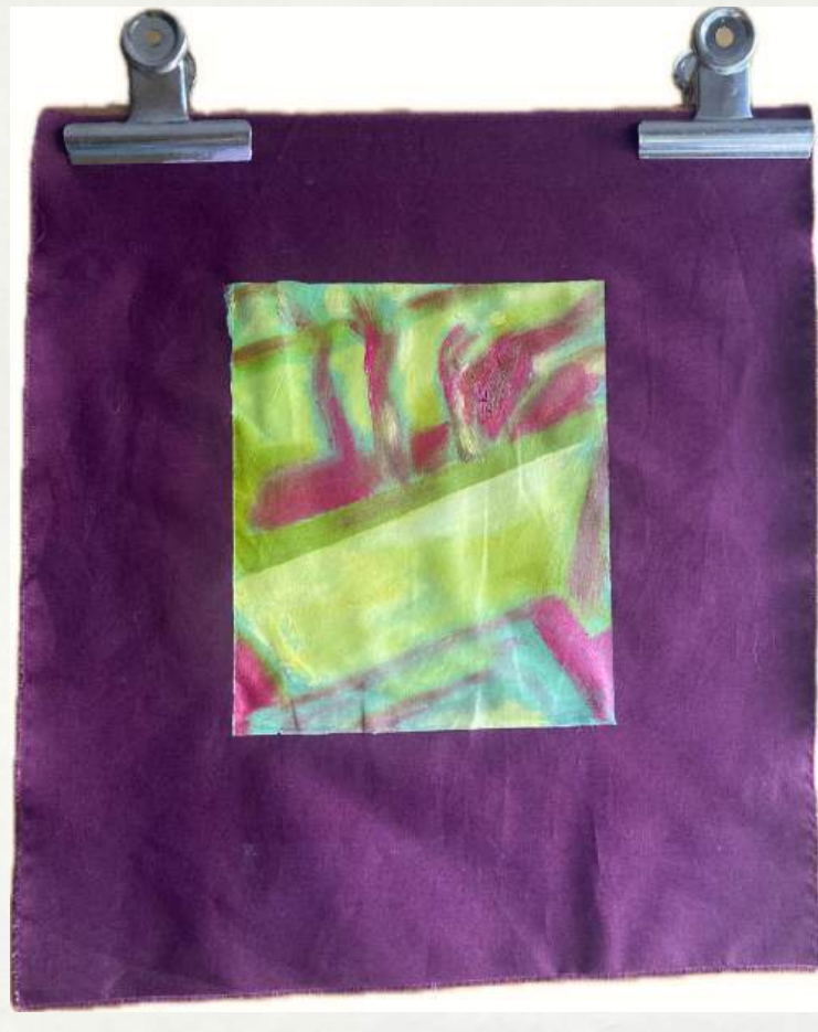
HIDE & SEEK