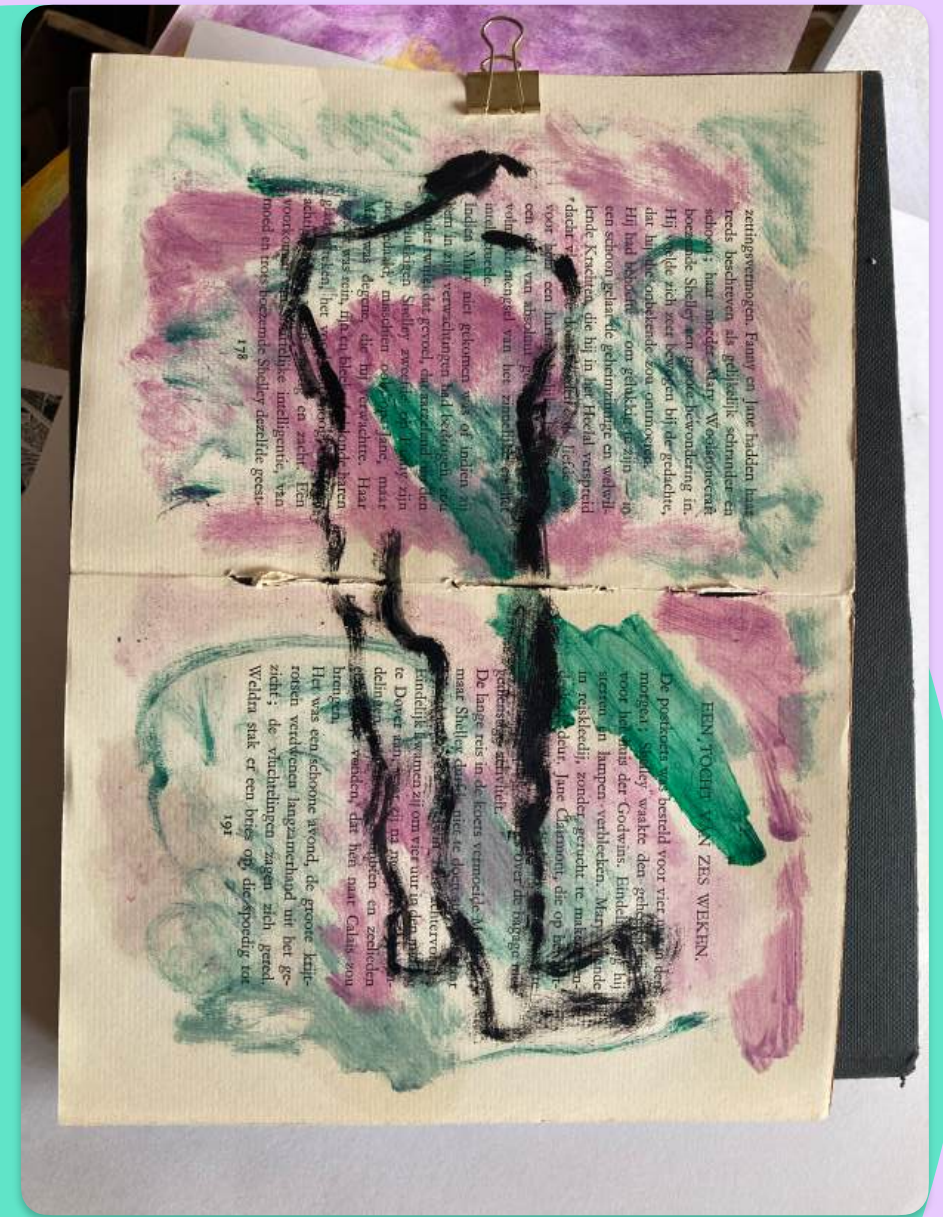
September Shower Darren, 2024

And luckily there is enough time leftover to celebrate birthdays, weddings and gorgeous people. But most importantly PAINT.