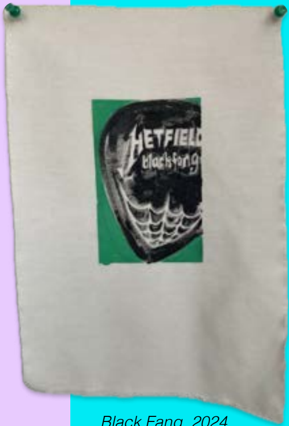
Black Fang, 2024

The two green and black paintings are some little vignettes I have been working on. Another series? Yeah - Why not?